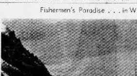
Fishermen's Paradise . . . in WI